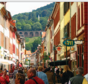
Heidelberg, Germany Site of 2012 ICLASS Conference