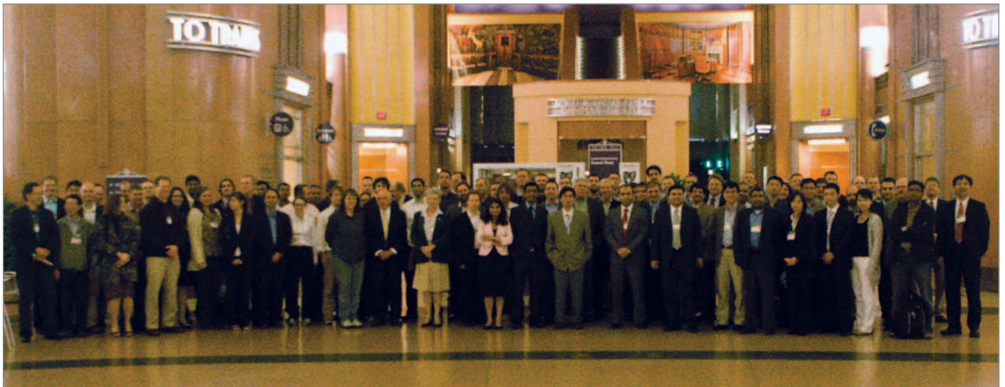
Attendees of the 2010 ILASS-Americas Conference