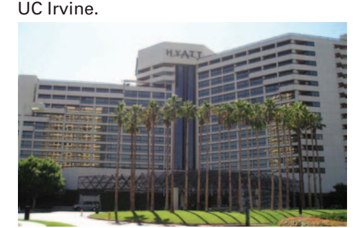
Hyatt Regency, Irvine, California

Co. were the exhibit coordinators. The conference sponsors were Solar Turbines, Goodrich, Spraying Systems Co., Mitsubishi, Nektar, Parker Aerospace, Woodward Aircraft Engine Systems, Proctor and Gamble, General Motors, Coen and