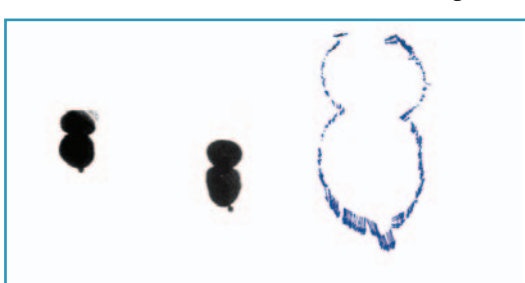
Figure 2a: Ballistic images of a droplet group. Figure 2b: Velocity vectors (only a few are shown for image clarity).

interface. Figure 2a contains an image pair representing the motion of one group of droplets. Figure 2b contains the velocity vectors extracted from those two images