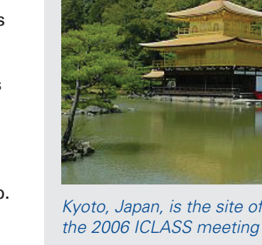
Kyoto, Japan, is the site of

Images were also made of a dripping flow spaced 1 ms apart to demonstrate an ability to image velocity of the liquid/gas